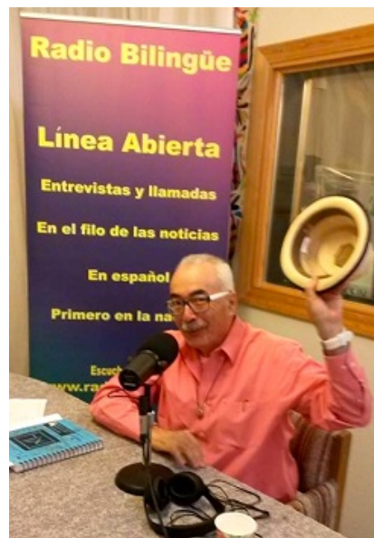
Juan Felipe Herrera

Thousands of past Línea Abierta programs are available online.