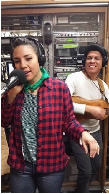
Las Cafeteras Performs Live on Radio Bilingüe

As Radio “Bilingüe,” some talk programs are bilingual and some music programs are in English or languages other than Spanish. Radio Bilingüe’s unique public affairs programs include Rockin’ da House , mixing music and information for the bilingual English-Spanish youth demo, and La Hora Mixteca , featuring music and information in Spanish and indigenous Mixtec, a major population group in farm worker communities of the United States.